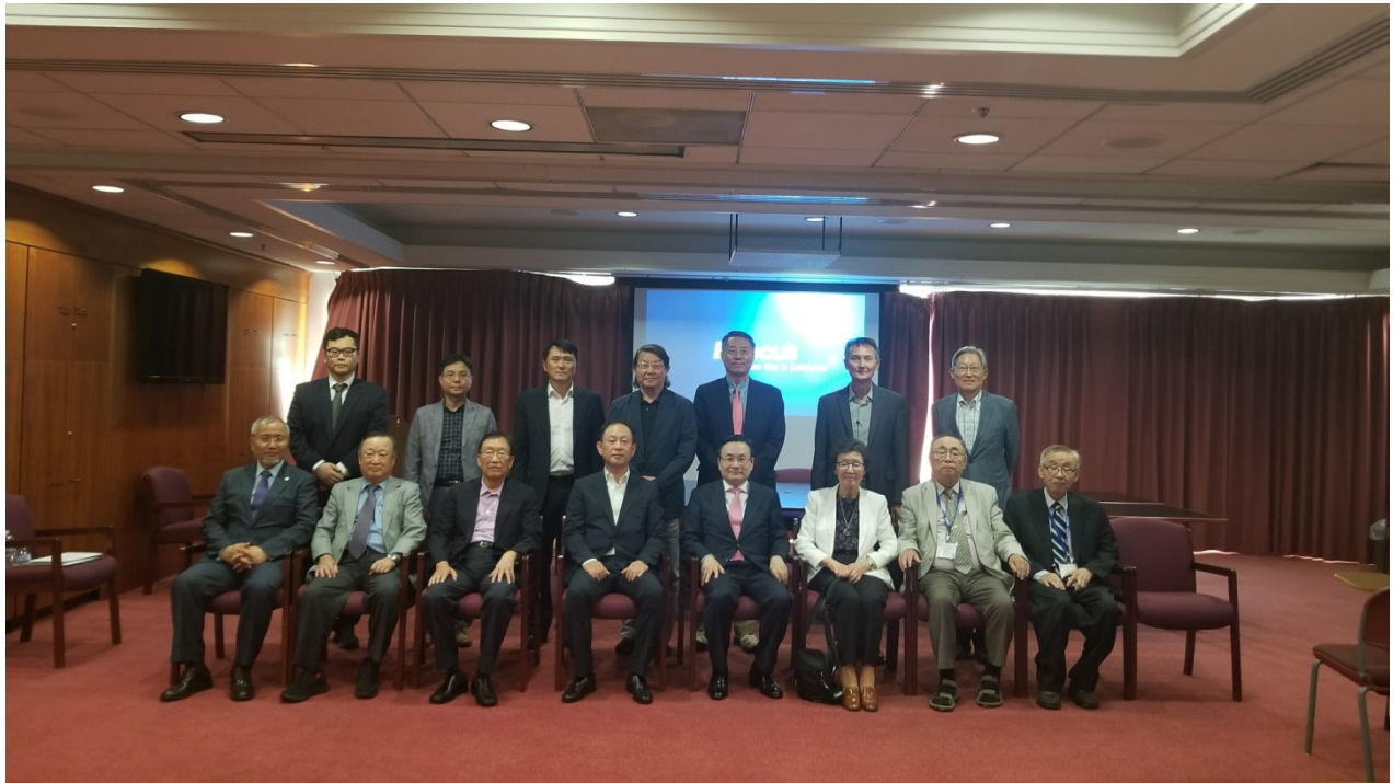
Photo: KAUPA Board and EC Members with Guests after General Assembly on 8/13/17